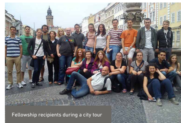
Fellowship recipients during a city tour